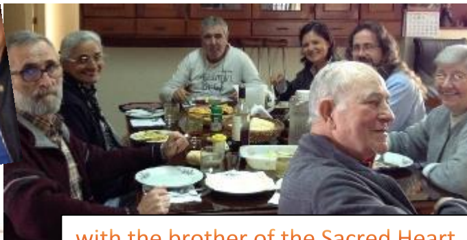
with the brother of the Sacred Heart