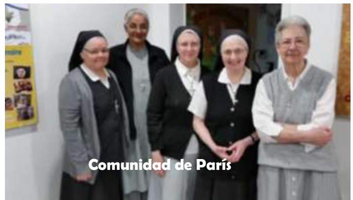
Comunidad de París

Some elderly religious are taken care of in the Infirmary of Lyon, there they receive the care and attention they need. With their prayer and the offering of their sufferings, they fortify and support the life and the apostolate of the Congregation.