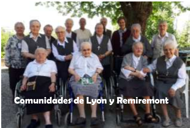
Comunidades de Lyon y Remiremont