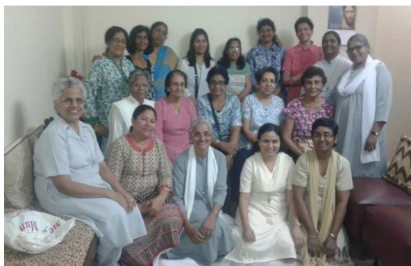
AFJM group at Marol - Mumbai

There are seven groups of AFJM in our various institutions. They meet regularly for prayer, input, sharing and planning the activities. Some of them are involved in parish activities, visiting the sick, prison, the elderly and helping the young. They had one recollection day at Khandala for all the groups. They are dynamic and enthusiastic to spread the charism and to promote vocations and work among the youth.