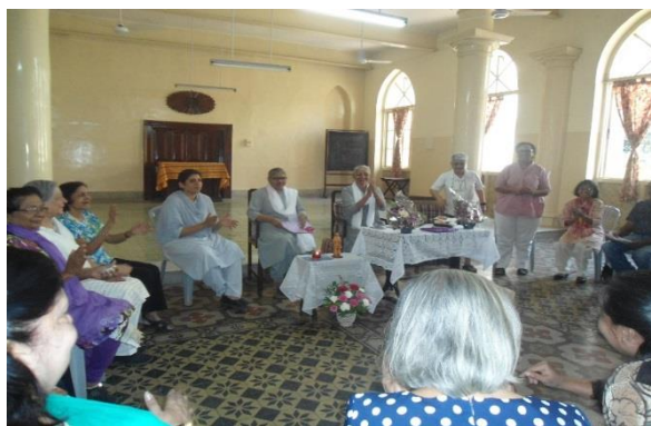
AFJM group at CJM Byculla – Mumbai