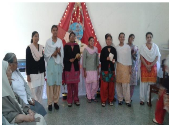
Postulants & Novices – Pune