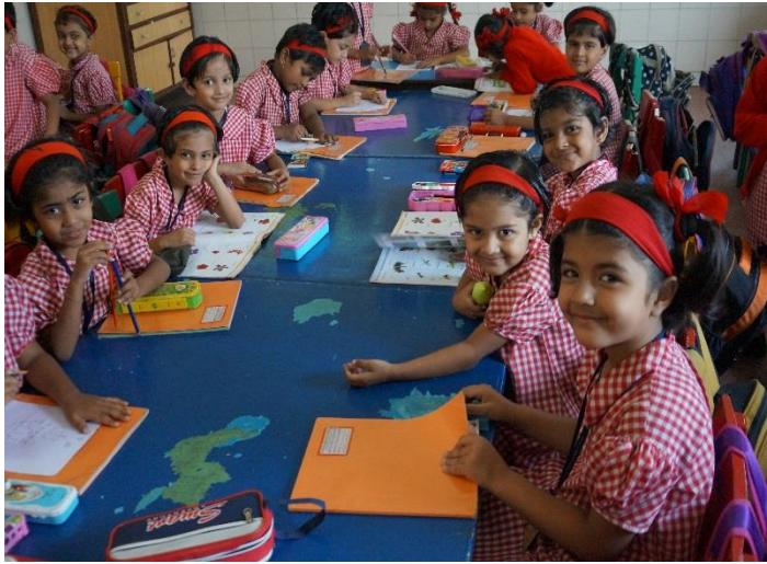
St. Felix's School