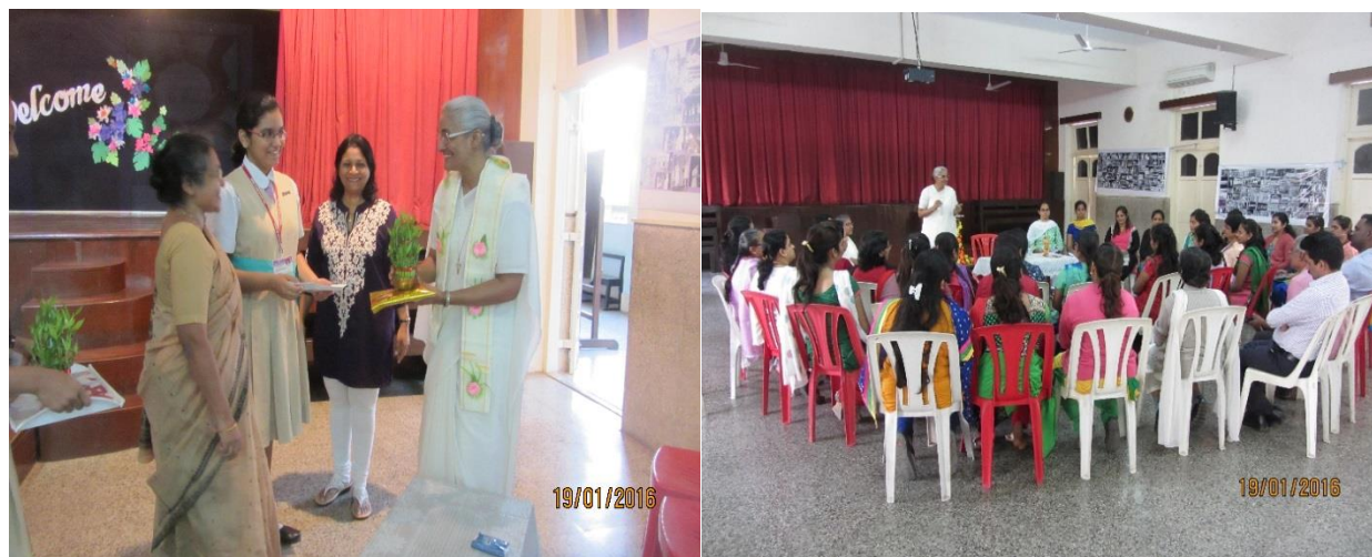
Nursing school students – CJM - Rahuri