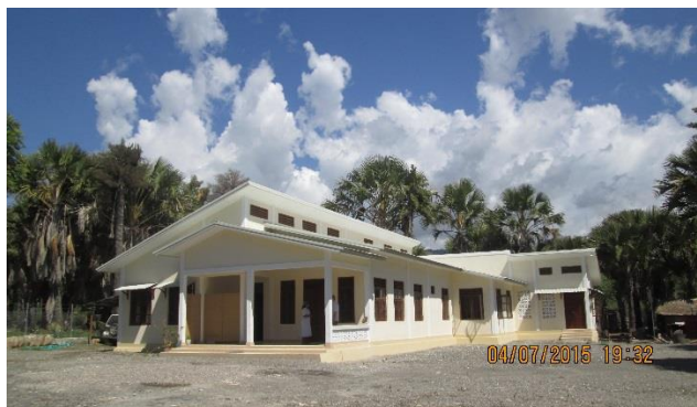
CJM– Timor Leste – New convent