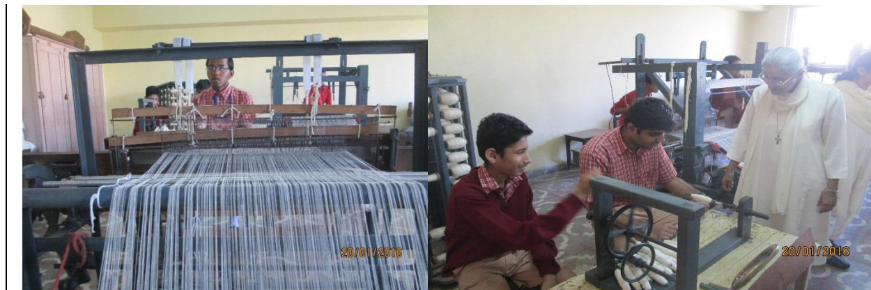
Cjm fort – Mumbai